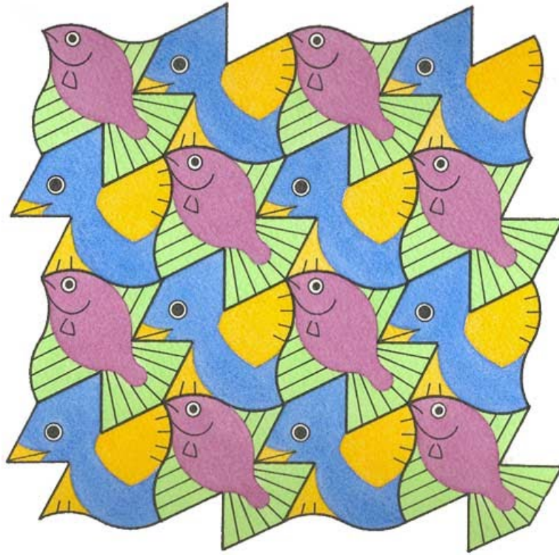
FIGURE 3. A tiling of the plane made of fish and birds.