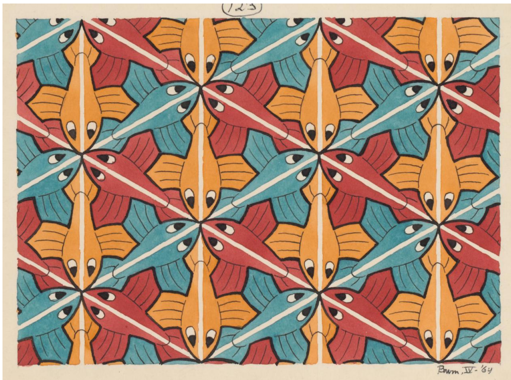
FIGURE 8. M.C. Escher's fish.