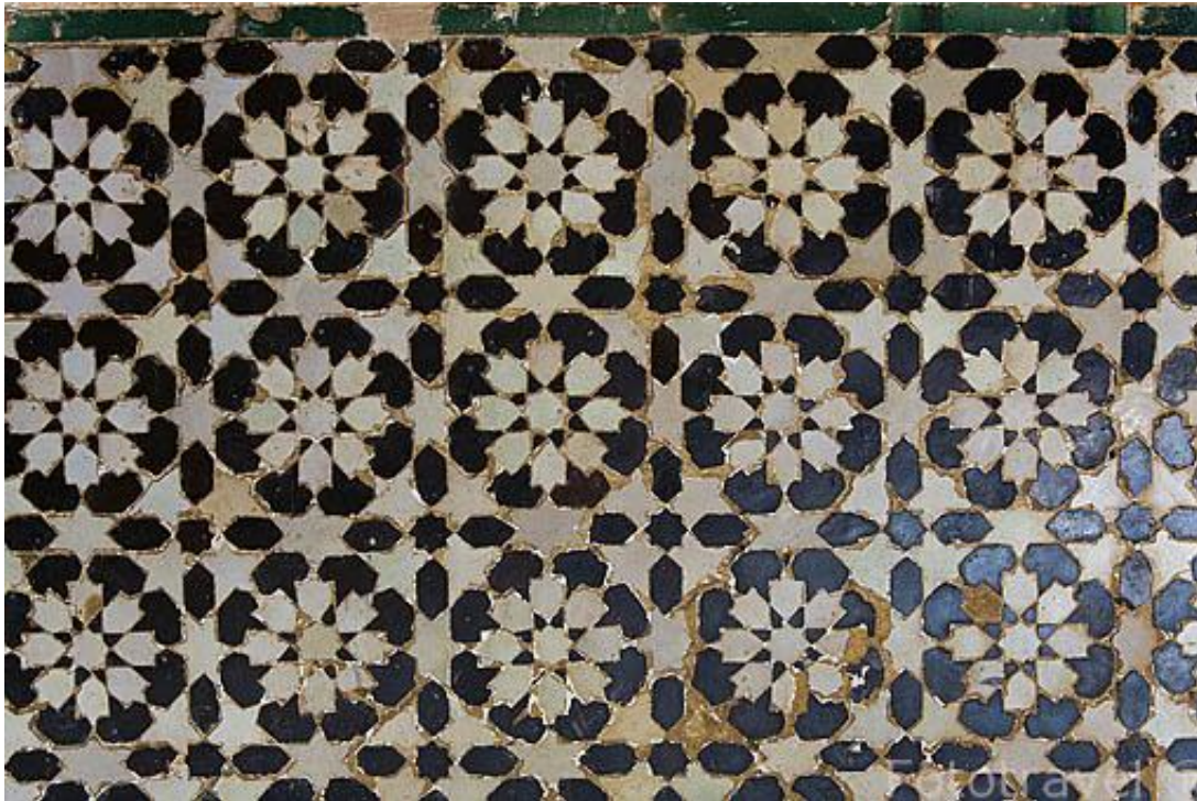
FIGURE 2. The pattern in La Torre de las Infantas in La Alhambra , Spain.