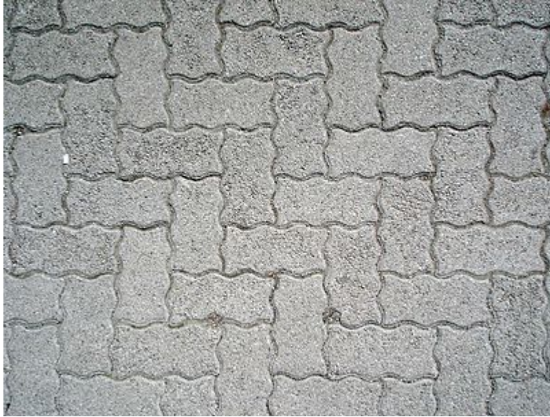
FIGURE 5. Second Brick Tiling.