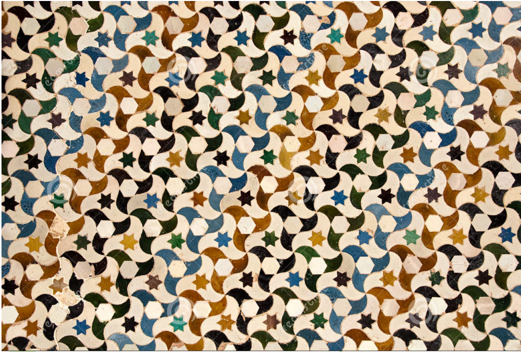
FIGURE 1. The pattern in the Patio de los Arrayanes in La Alhambra , Spain.