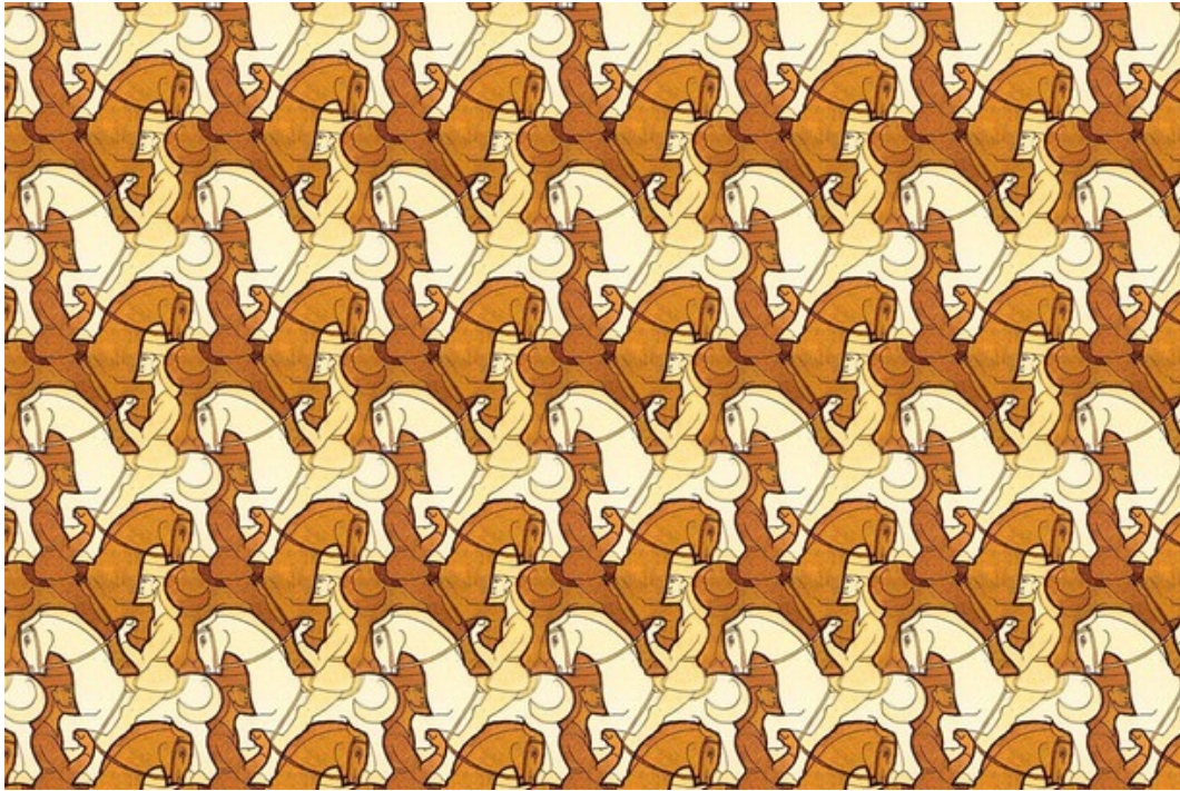
FIGURE 7. General in Horse Tiling.