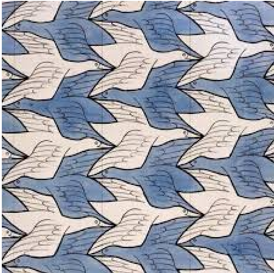
FIGURE 6. M.C. Escher Birds.