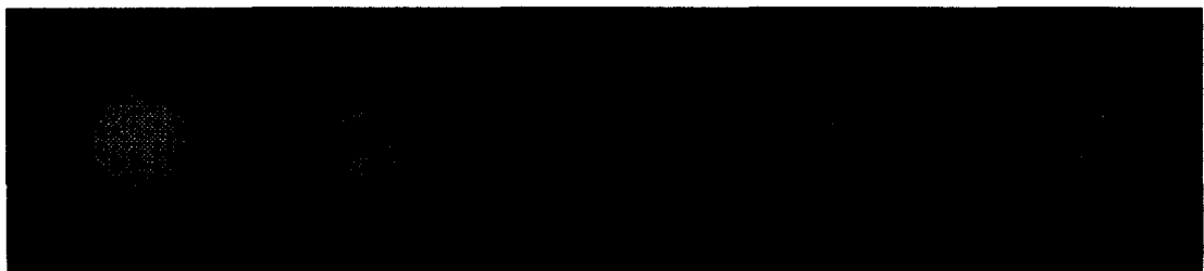
Fig. 2. A group of test images.

Test images are segmented by thresholding them as described above. A sequence of 14 threshold values labelled from 1-4 are taken to segment each group of images. The five evaluation methods are then applied to the segmented images. The values of corresponding